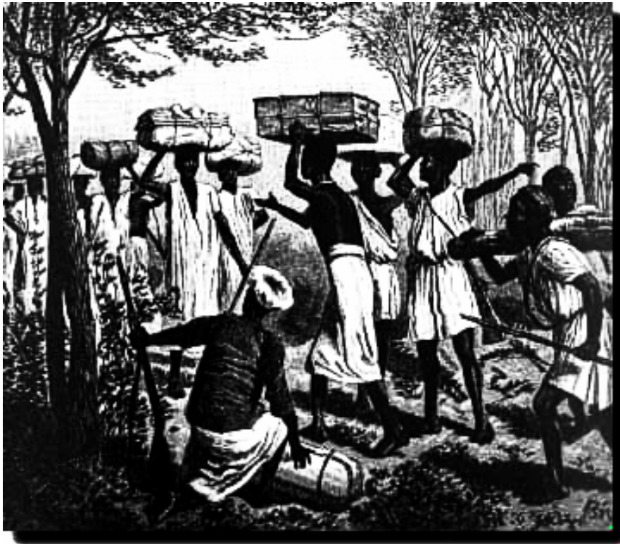
A sketch of porters transporting goods in an expedition

European interest in East Africa at this time developed fast, although most of the contacts were being made in Zanzibar. Zanzibar was now the Omani Sultanate's headquarters instead of Muscat.