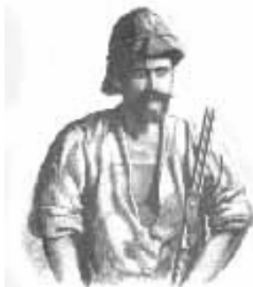
An early settler

The most determined and successful of all pioneers, and the one who soon became their leader was Baron Delamere. His ordeal is beautifully described in the book "The White Man Country" by Elspeth Huxley. Delamere happen to arrive in the highlands during a hunting expedition which started in Somalia. The highlands conquered his heart and he sold his state in England to make his home in Kenya. He invested all he had in making farming possible in Kenya. He tried all type of ventures, sheep, cattle, wheat, ... etc. and he more often failed than succeed. Nevertheless he managed to adapt many foreign products to the local conditions and moreover created a tradition of research which is prevalent nowadays in Kenya. Ultimately two crops prevailed: coffee and tea, both well suited to cultivation in the central highland area of Kenya.