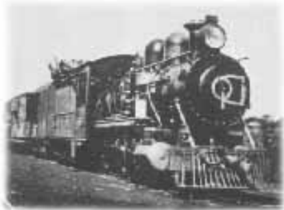
The lunatic express

The construction was fast in spite of the delays due to malaria, man-eaters and looting and attacks from hostile tribes. The sleepers had to be made out of steel, since wood was eaten by hungry termites. The track had to go up to 1,150 metres, cross the Equator, go down the rift valley and climb it back in drops of 600 metres, and cross a 160 kilometres swamp. It was a human and engineering master piece which still surprises us to this day. On December 20th, 1901 the last key was placed on the shores of Lake Victoria by the wife of the chief engineer Ronald Preston.