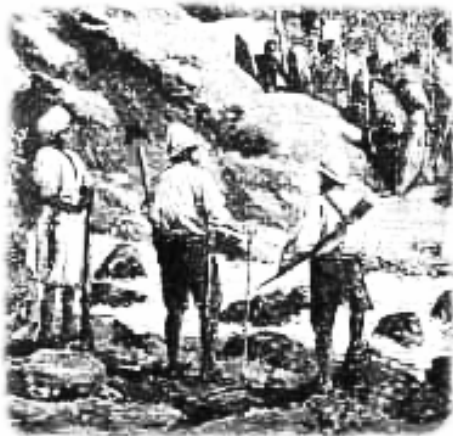
Burton and Speke

Richard Burton and John Speke, both British soldiers, decide to search out the source of the Nile. In 1857 they parted from Zanzibar and followed the Arab trade route from Bagamoyo to Lake Tanganyika. Due to recurrent illness they could not explore the totality of the lake. Speke though managed to see and name Lake Victoria from Nyanza. He had the hint it was the source of the Nile but he could not prove it. Burton, who had remained behind due to fever refuse to believe him and they become bitter enemies since then.